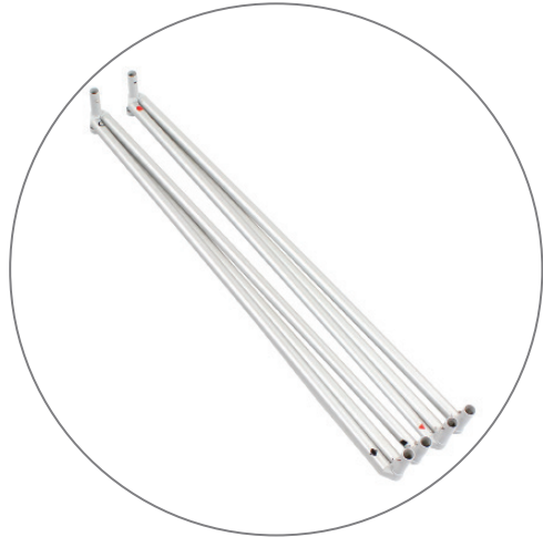
Qty 2 - Triangular End Tubes