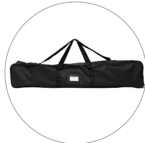
Qty 2 - Screw Knobs