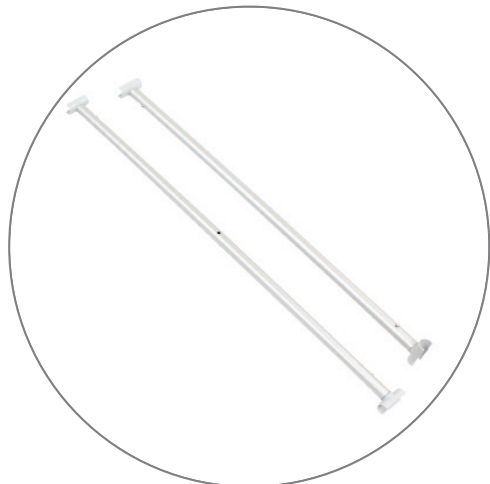
Qty 2 - Support Tubes