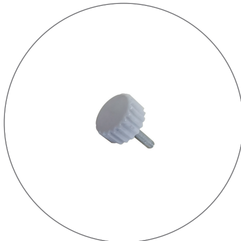
Qty 2 - Screw Knobs