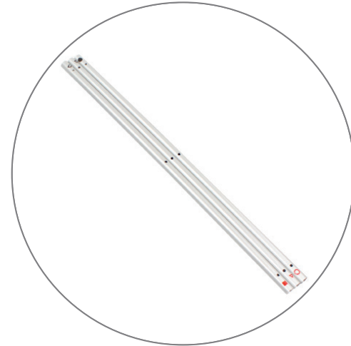
Qty 3 - 39.25" Tubes