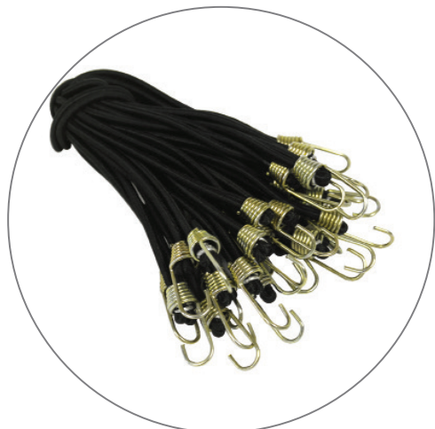
Qty 28 - Bungee Cord w/hook (only used with scrim banners)