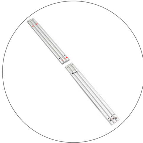
Qty 6 - 19.75" Tubes