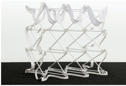
1. Expand the frame