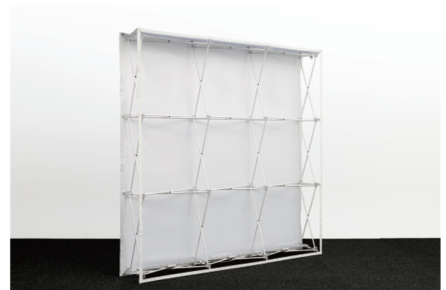
Back graphic installed