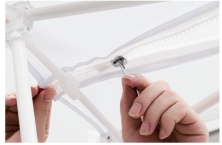
3. Zip top fabric cover closed