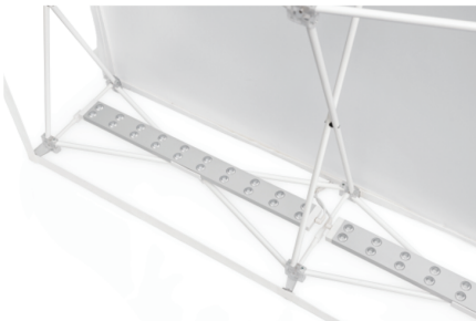
4. Clip edge lights to bottom X rods & connect Y-cables to lights & transformer