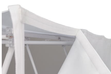
5. Attach front and back graphics to velcro strips around frame